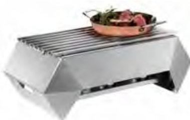
Diamond Multi-Chef™ Stainless Steel 10” Kit