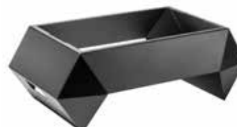
Diamond Multi-Chef™ Black Matte Frame 10”