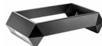
Diamond Multi-Chef™ Black Matte Frame 7”