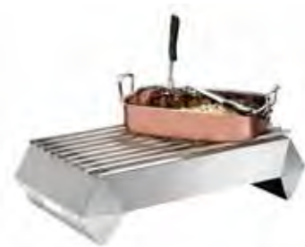
Diamond Multi-Chef™ Stainless Steel 7” Kit