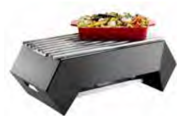
Diamond Multi-Chef™ Black Matte 10” Kit