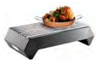
Diamond Multi-Chef™ Black Matte 7” Kit