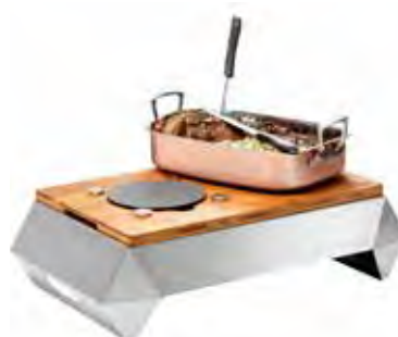
Diamond Multi-Chef™ Stainless Steel Frame 7”