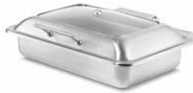
Soft Closing Chafing Pod