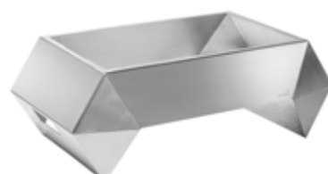
Diamond Multi-Chef™ Stainless Steel Frame 10”