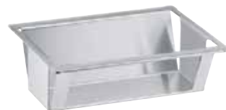
Burner holder for stands GN 2/3 and round Cromargan® 26 x 20 x 8 cm / 10¼ x 8 x 3¼ in. 06.3322.6039