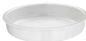
Porcelain insert round depth 70 mm / 2¾ in. Ø 33,5 cm / 13¼ in. 60.3072.9990