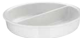
Porcelain insert round, divided depth 70 mm / 2¾ in. Ø 33,5 cm / 13¼ in. 60.3073.9990