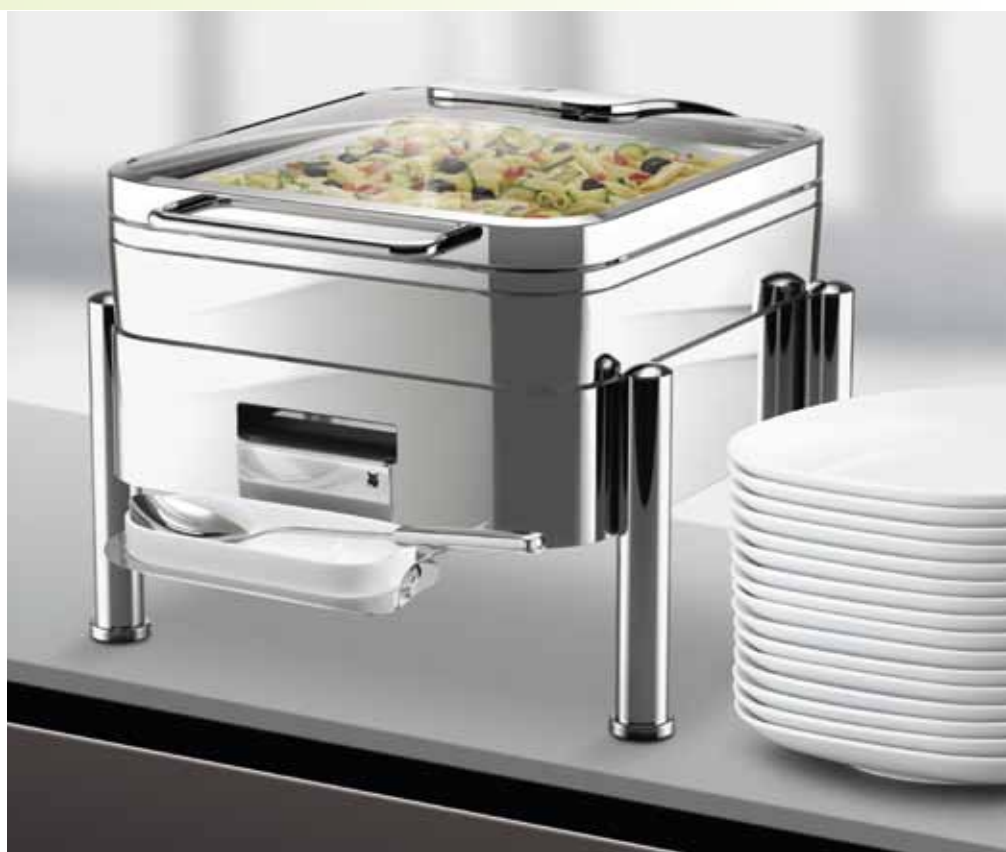
Porcelain bowl porcelain, white 60.3540.9990