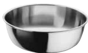
Insert Cromargan® round depth 80 mm / 3¼ in. 06.2083.6034

Even the best product needs the right accessories to set it off to perfection. The WMF Chafing Dish VITALIS PRO range has all the right accessories.