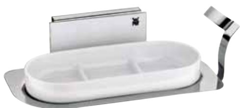
Tray/cutlery holder Cromargan® 06.3539.6040

With taste and style, the elegant porcelain and Cromargan® WMF utensil rack is the perfect complement to the WMF VITALIS PRO chafing dish. Just slot it in, place the serving spoon on top and that's it!