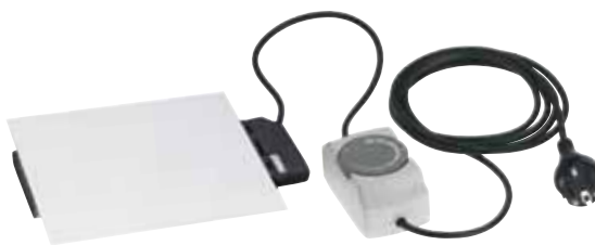
Heating element for stands GN 2/3 and round 230 V / 700 W heat adjustable 25 x 20 cm / 9¾ x 8 in. 06.3286.6046